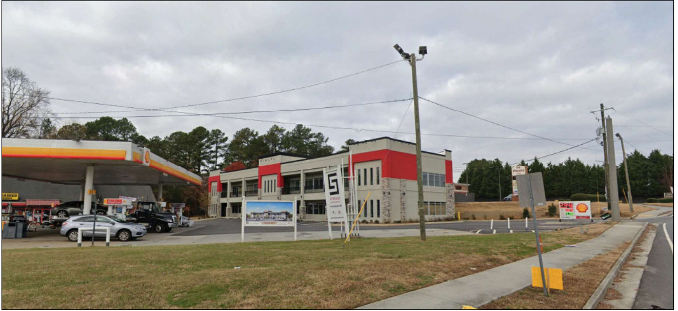
6405 Peachtree Industrial Boulevard, Peachtree Corners, GA 30092