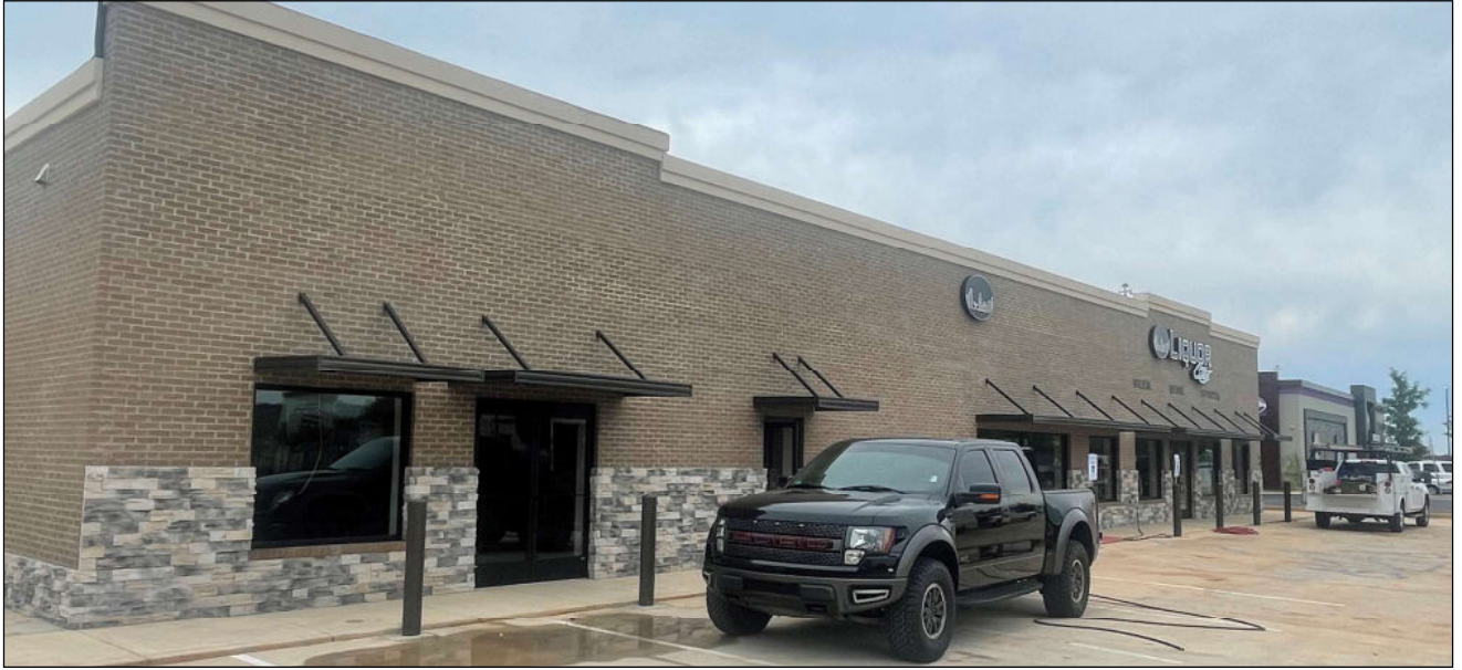
1498 Sam Nunn Blvd, Perry, GA 31069