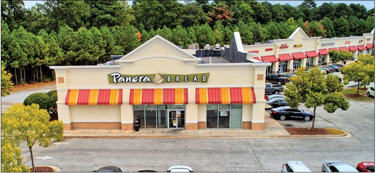
8200 Mall Parkway, Lithonia, GA 30038

Ideally Located in Lithonia's Main Retail Corridor