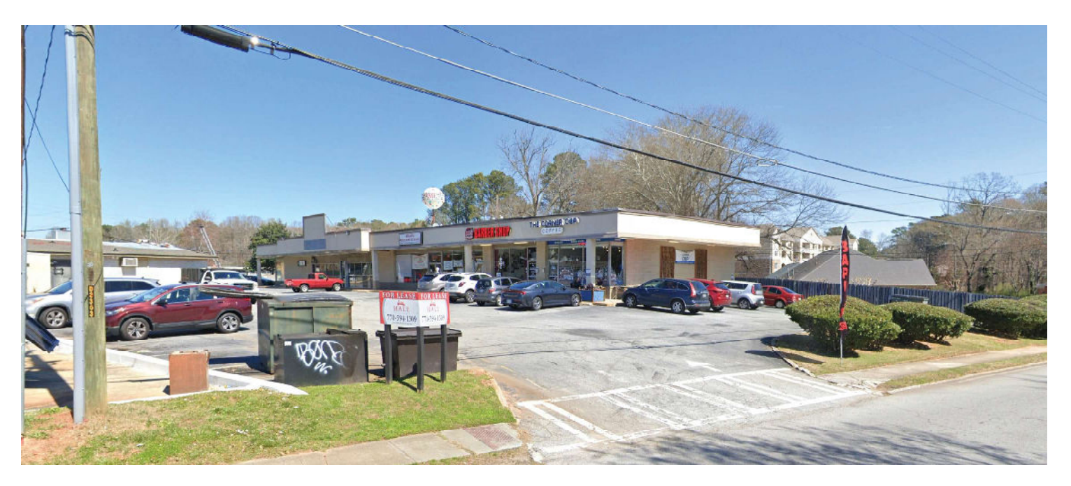
2,800 SF Space Available