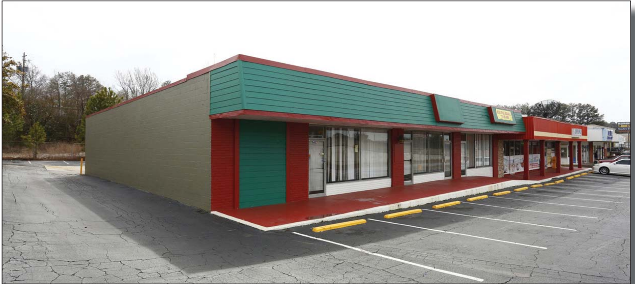
6829 Peachtree Industrial Blvd, Doraville, GA 30360

Free Standing Building On Busy Peachtree Industrial Blvd