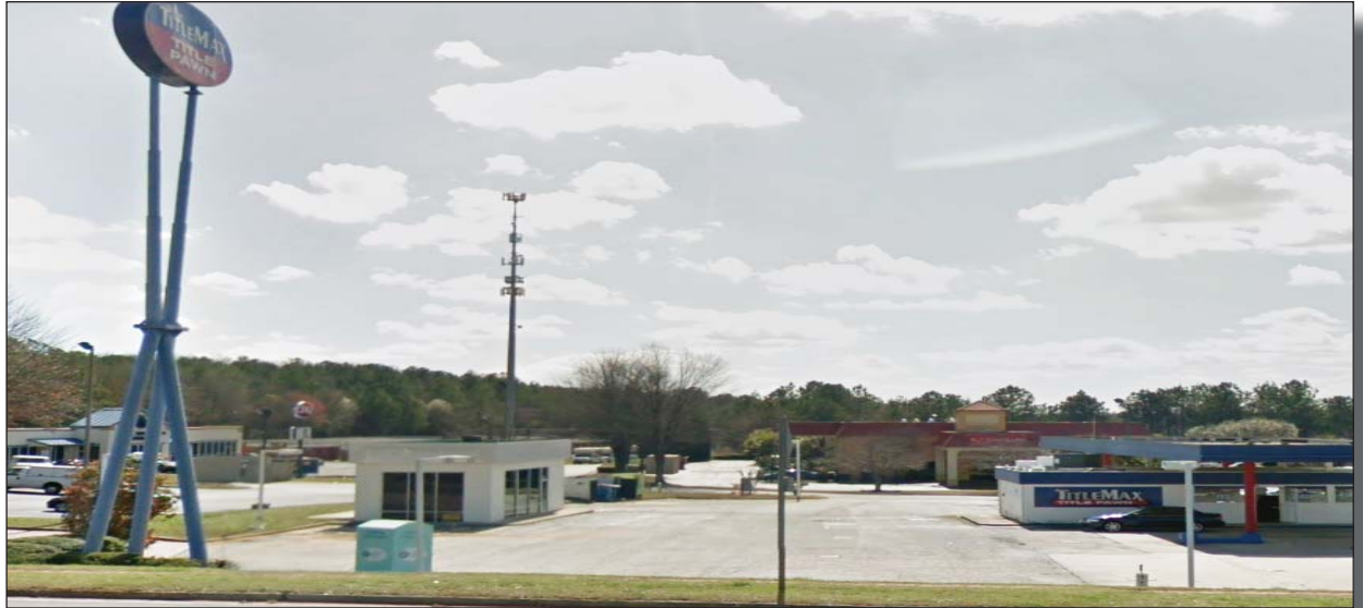
7348 Davidson Parkway, Suite B, Stockbridge, GA 30281