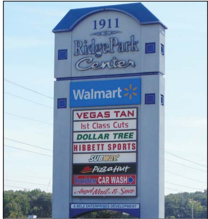
24,067 Total Square Feet (76.82% Occupied)